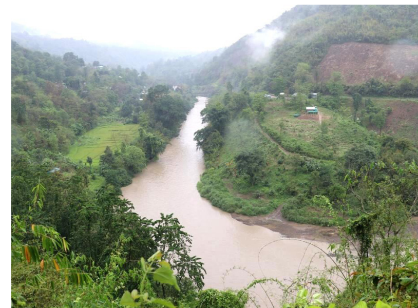
Irang River flowing freely in Manipur. Series of hydroelectric projects are planned over these Rivers.

The most challenging aspect of the Draft EIA Notification 2020 is the wide-ranging freedom given to project proponents to engage in violation of conditions under which they were granted environmental clearance. "Dealing with violation cases" is a new section in the draft notification, that overlooks all type of violation relating to forest clearance and other environmental violation by simply imposing fines, categorize the terms of violation in four ways -- Suo moto application of the project proponent; or reporting by any government authority; found during the appraisal by Appraisal Committee; or any violation found during the processing of application by regulatory authorities. The draft condones violation of any environmental norms by simply imposing fines, graded depending upon whether the project proponent admits to such violations or exposed by government agency. The levy of fine of project proponents by declaring a 'crime' as a 'non-crime' legitimizes the violation. The draft EIA 2020 undermines the orders of the National Green Tribunal that ruled against post-