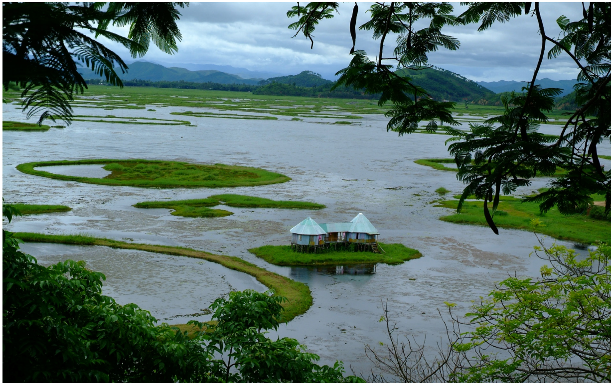
A spectacular view of Loktak Lake in Manipur

of large dams, oil exploration and mining in Manipur have long caused controversy over environmental and social impacts, which affected communities highlighted in “environmental public hearings”. The regulatory dilution will further deny peoples’ right to assert concerns in public hearing on impacts of unsustainable projects. The draft EIA 2020 will usher in catastrophic changes to indigenous peoples’ way of life by unleashing rights violation, eviction, and ecological destruction.