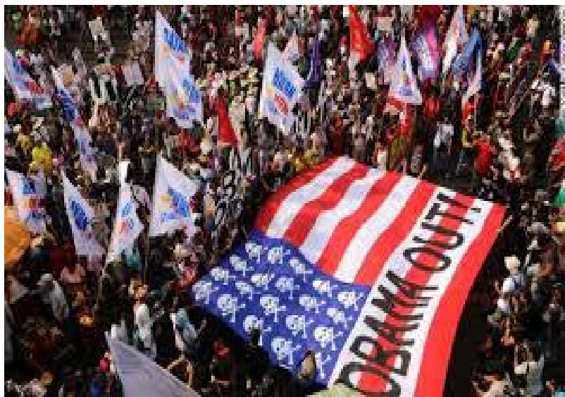
OBAMA OUT. Militants took the streets during the Manila visit of US President Barack Obama last April 29. They protested US intervention to country’s sovereignty and the signing of the Enhanced Defense Cooperation Agreement (EDCA).

“In the three decades of liberalization, the key economic sectors of manufacturing and agriculture have been in